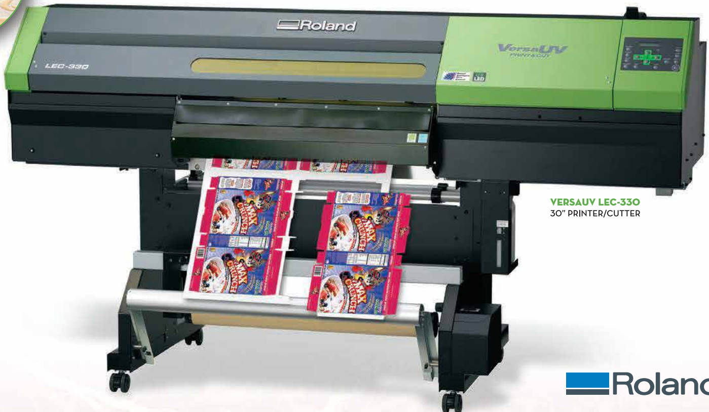
VERSAUV LEC-330 30" PRINTER/CUTTER

Folding carton prototypes in minutes, not hours.