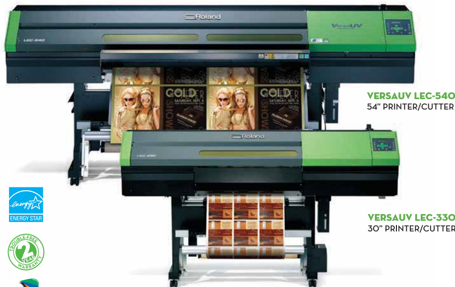
VERSAUV LEC-540 54" PRINTER/CUTTER