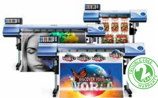
VERSACAMM VS-300i 30" PRINTER/CUTTER