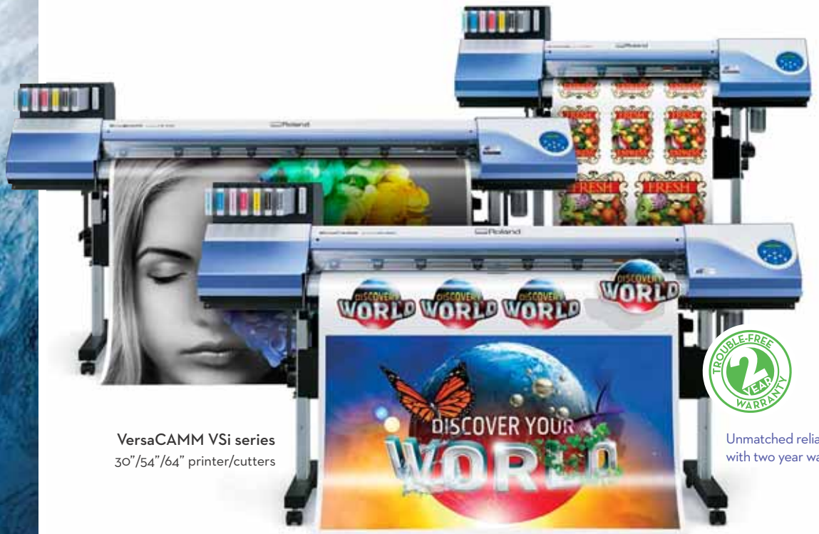
VersaCAMM VSi series 30"/54"/64" printer/cutters

Unmatched reliability, with two year warranty.